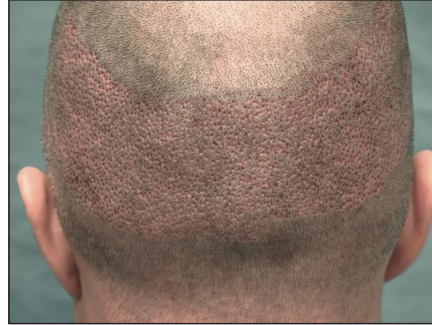
Photo 2, Day 2 following the ARTAS procedure