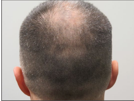
Photo 1, Pre-operative