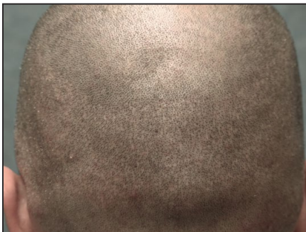
Photo 5, Shaved with peanut clippers 1.5mm